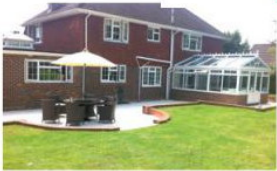
Proud members of

Checkatrade.com Where reputation matters